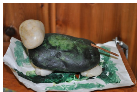
A Child's Recreation of a Turtle